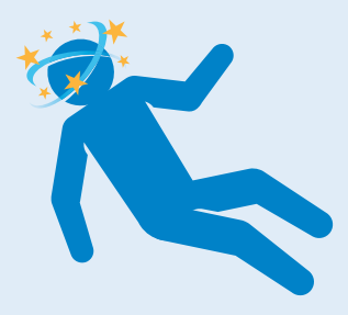
Victims pass out suddenly & can't call for help